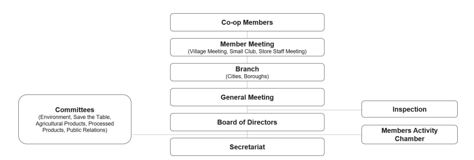
Figure 2. Governance structure of local Hansalim organizations